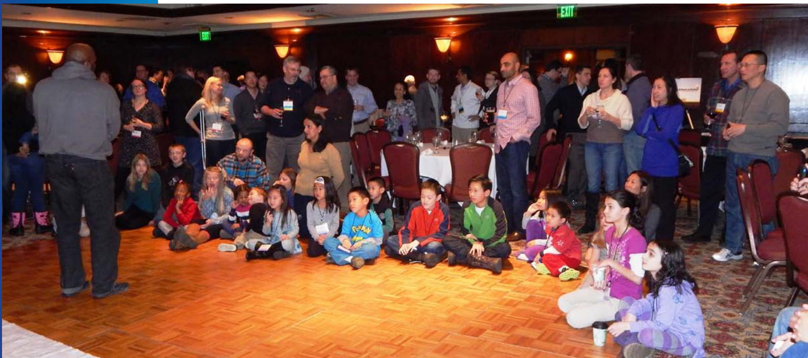
Rapt attention to the bird show by kids and adults alike