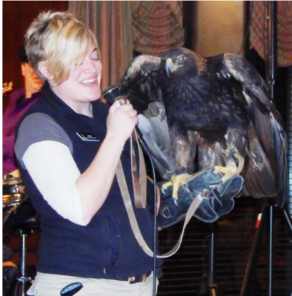
Birds of Prey Show before the President's Dinner . Shown here a Colorado Golden Eagle